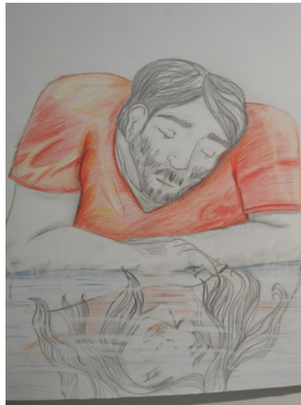
Figure 2: Who am I? Kvindemuseet, Denmark

And these questions are now being asked. Feminist adult education is proving to be a toolbox of ideas and strategies that can be applied equally to struggles of gay, queer, two spirited, trans and non-binary peoples (Kirkgaesser, in press). My own work in this area has been to focus on women's and gender museums. For these institutions, the perception of what and how gender means matters; how we see, talk (or do not talk) about and act out gender matters. I am exploring how these institutions use their practices of representation, to return to the aesthetic, to encourage a deeper knowledge of the importance of gender, to render visible and challenge the gender structures of power and the epistemologies and representations of mastery that have placed heterosexual men at the centre of the world's story. I am finding that these theirs's is pedagogy of radical imagination and as such, a new source of power and hope in the world.