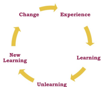
The learning change diagram

new can make them uncomfortable, cause anxiety and stress. Furthermore, what they learn and how they practice what they have learned is greatly influenced by the learning experience. If the learning environment is positive, where the young adult earns praise for being curious to learn, then they will be stimulated to repeatedly practice their new learnings, and eventually make it part of their daily lives. But, if the experience is disappointing, or the learning environment is not stimulating, then they won't be interested to learn anything new.