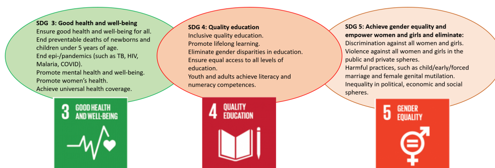
Figure 1: The interrelationship between quality education, gender equality, and health and well-being

Education (SDG 4) precedes and directs the motion and intensity of the other SDGs, and we argue that the accomplishment of SDG 4 will, in addition, aid in redressing health issues (SDG 3) and gender equality (SDG 5) (see Figure 1; also English & Mayo, 2021).