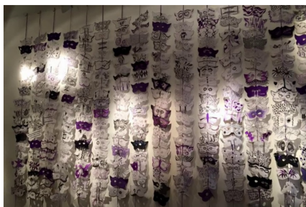
Figure 1: Mask installation, Museo de la mujer, Argentina

suspected” (Vintges, 2018, p. 165). A recent study by Shameen (2021) illuminates a disturbing “global patriarchal backlash [of] rising fundamentalist and fascist agendas” (p. 2). She has round that the “forces of extremism, cultural imperialism, ideological colonization...and the (re)imposition of patriarchal heteronormative family values...are shaping the parameters of public discourse and consciousness” (p. 10). Through policy, rights are curbed; through the power of social media, messages of misogyny, intolerance and ‘white’ masculine supremacy invade the homes and lives of millions across the globe (p. 10). In addition, there is rise in the vilification of “feminism as the primary threat to public morality” (p. 10). The vacant masks in Figure 1 below were made during a women and domestic violence workshop at the Women’s Museum Argentina. This installation visually represents but a few of the women murdered by their partners during 2020, the first year of the coronavirus global shutdown.