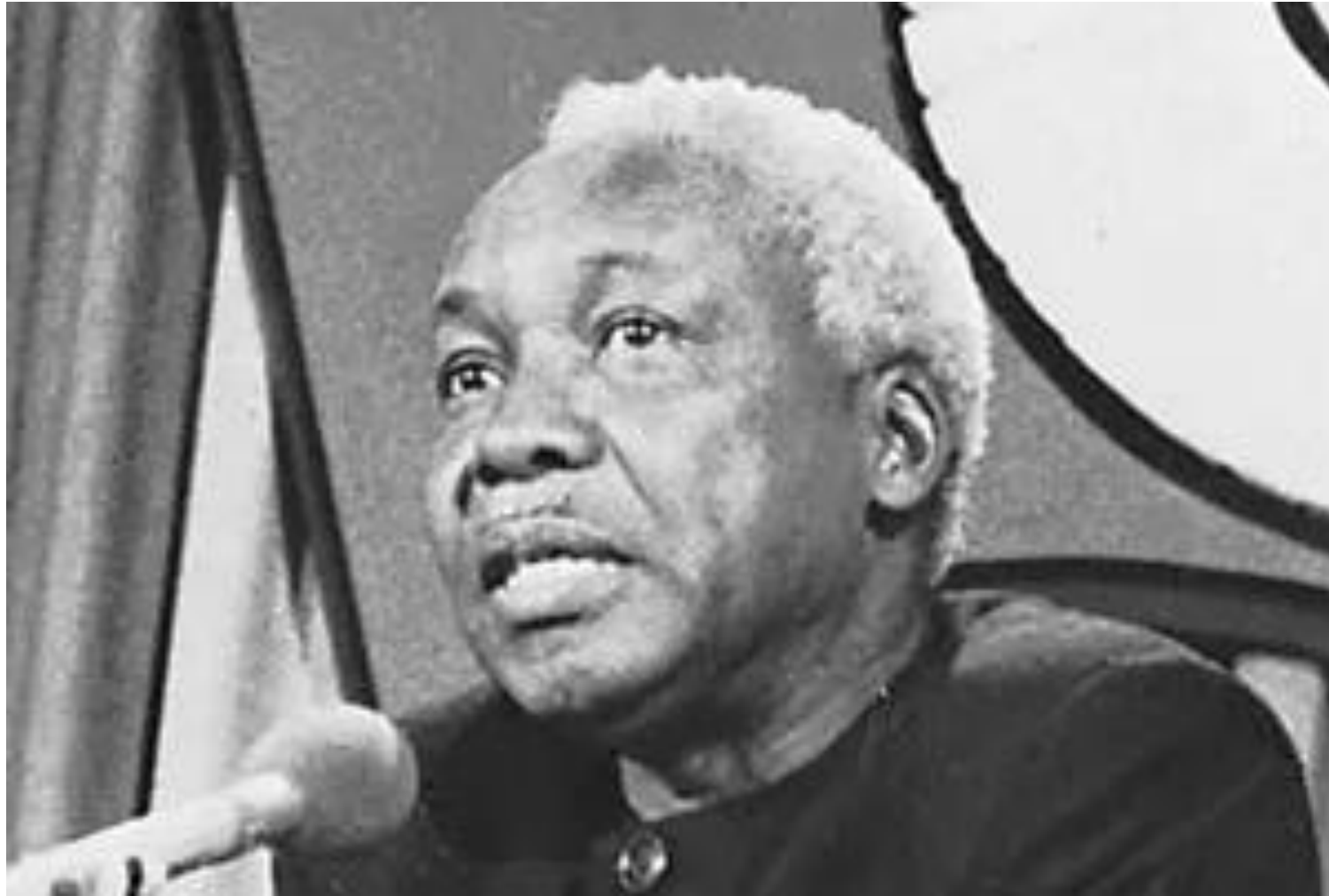
Mwalimu Julius K Nyerere, President, United Republic of Tanzania Keynote Speech